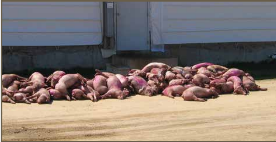
HIGH DEATH LOSS